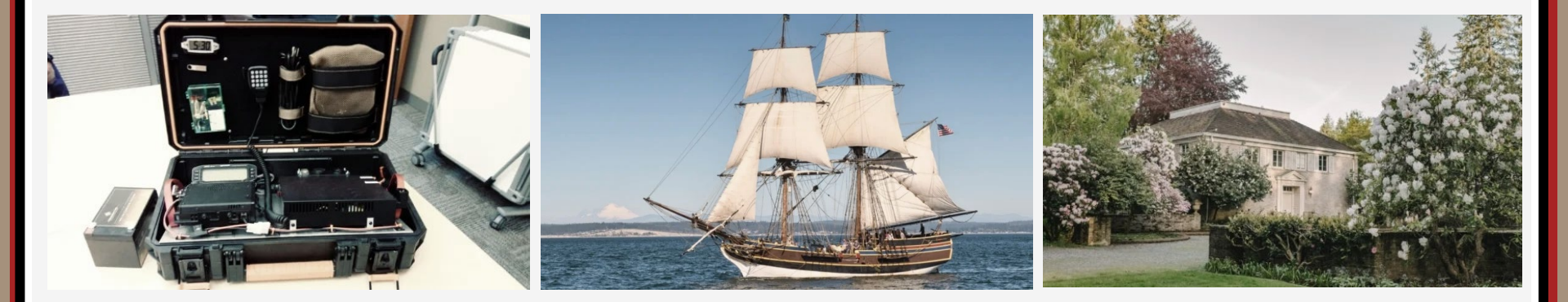
"Go Kit" emergency radios for Pierce County

Grain storage for horse rescue nonprofit in Port Orchard, WA